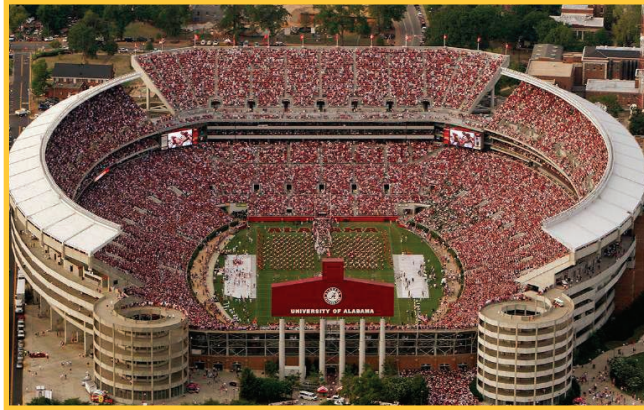
Bryant-Denny Stadium, University of Alabama